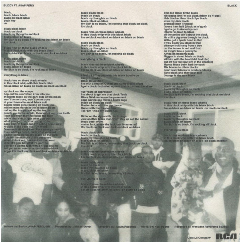
"Black" single art back