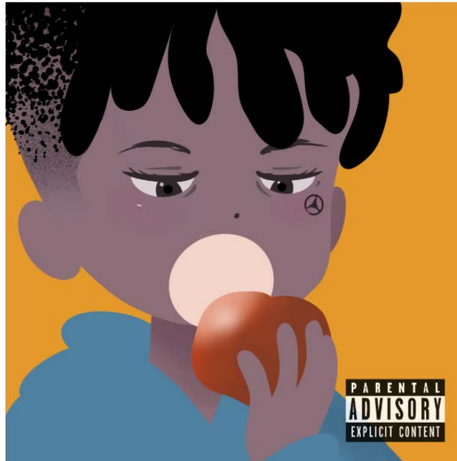
“A Lot On Ur Plate” Artwork by Father

[August 14, 2019 – New York, NY] Atlanta rapper/producer/artist Father returns today with the release of his new track and accompanying video for “ A lot on ur plate ” via Awful Records/RCA Records . Click HERE to watch.