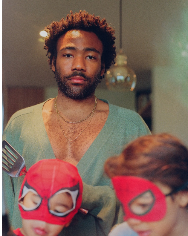
New Press Photo/Photo credit: Pavielle Garcia

VISIT DONALDGLOVERPRESENTS.COM FOR A LIVE GLOBAL COMMUNAL EXPERIENCE