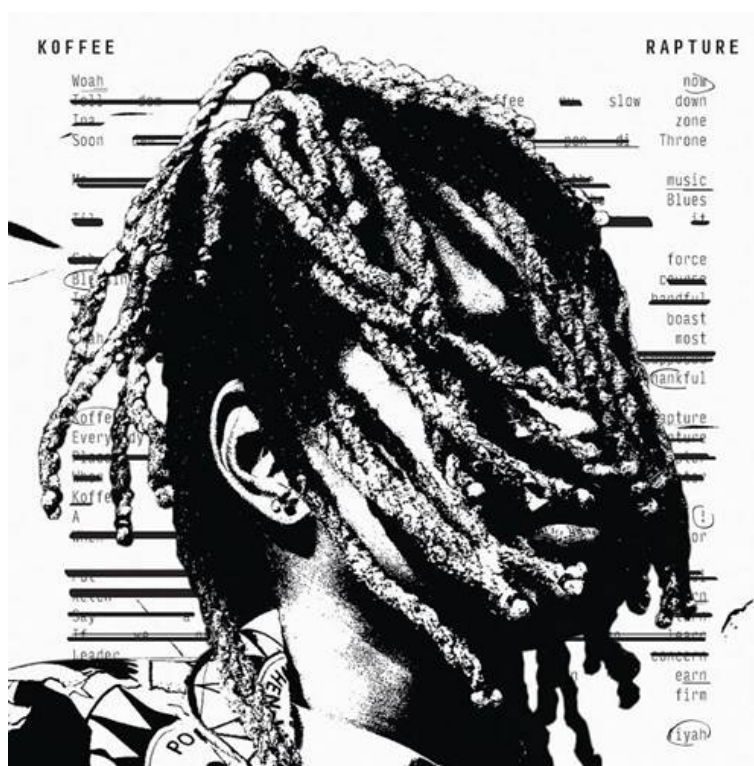
Rapture cover art

Watch "Rapture" feat. Govana above, see EP details below, and stay tuned for more from Koffee coming soon.