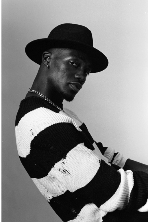
High Res photo HERE

LISTEN HERE- https://tobi.lnk.to/DollasandCentsRemix