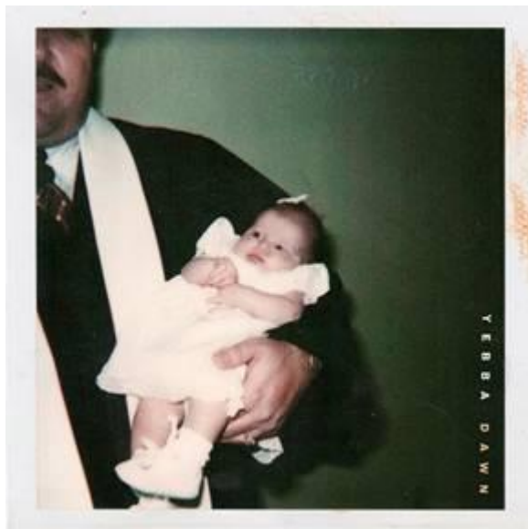
Dawn album cover art HERE

“...the glimmer of a generation-defining and defying talent.” – Ones To Watch