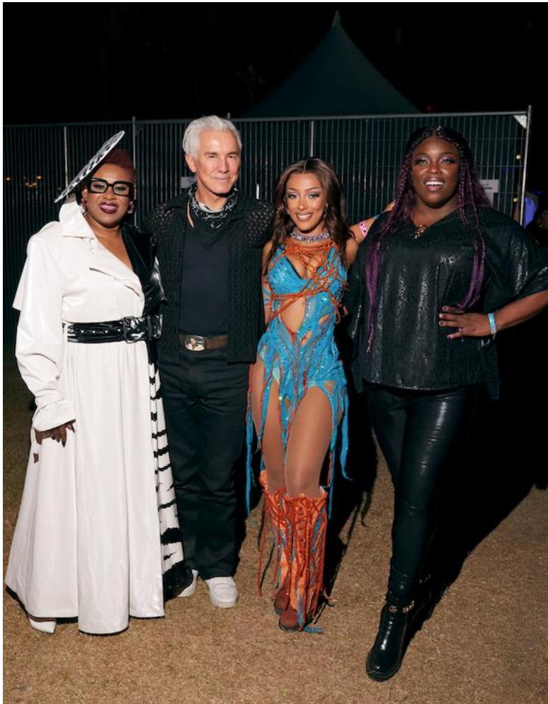
From Left to Right: Shonka, Baz Luhrmann, Doja Cat, Yola

RCA RECORDS TO RELEASE THE ELVIS ORIGINAL MOTION PICTURE SOUNDTRACK THIS SUMMER FOR BAZ LUHRMANN'S FORTHCOMING FILM ELVIS , STARRING AUSTIN BUTLER AND TOM HANKS, IN THEATERS JUNE 24 TH LEAD SINGLE – DOJA CAT'S "VEGAS" – OUT MAY 6 TH DEBUTED FOR THE FIRST TIME AT COACHELLA